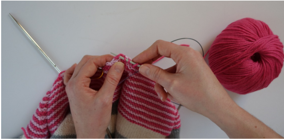
Picking up stitches for the collar

If you feel like you would like to watch a video using this technique, click here to view!